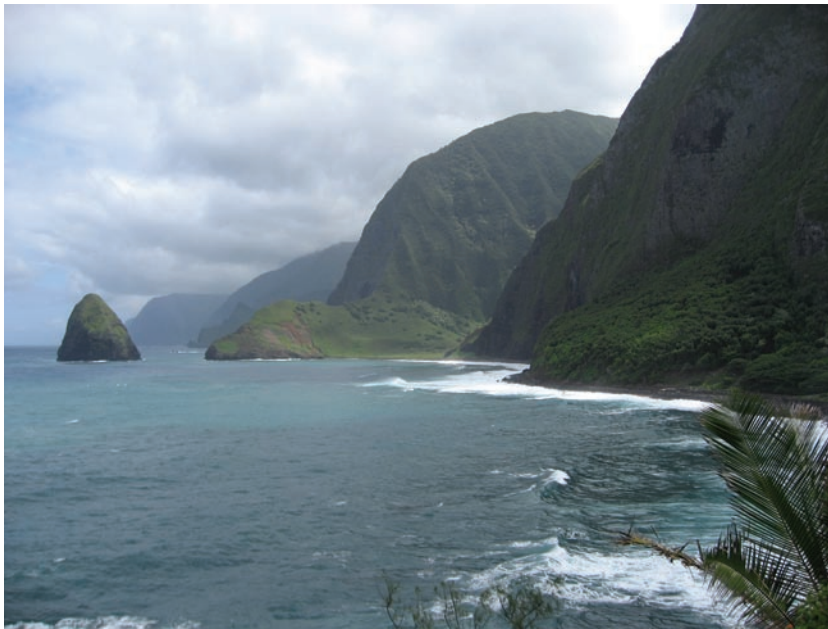
Figure 1 The cliffs of Kalaupapa. The view is from Kalawao, the initial residential community for the patients, on the eastern side of the Kalaupapa peninsula.